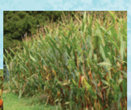
excellent fertiliser. faeces are excellent soil conditioners

The benefits of dry urine diverting toilets